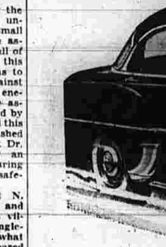
Above: The "Two-Ten" 4-Door Sedan. At right: The "One-Fifty" 2-Door Sedan, two of 14 beautiful models in 3 great new series.

Again in 1953... Chevrolet is lowest priced!